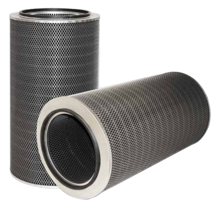
Ultra-Web Conductive FR Cartridge